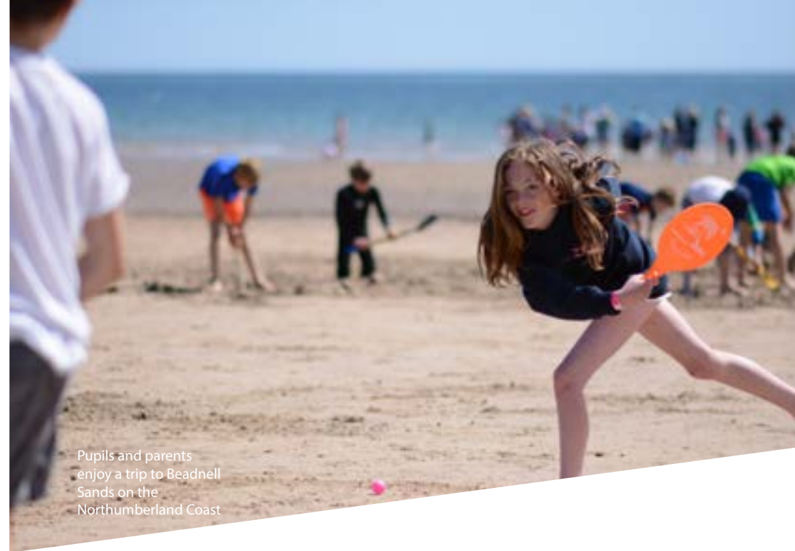
Pupils and parents enjoy a trip to Beadnell Sands on the Northumberland Coast

The Yorkshire 3 Peaks day trip for Form 6 which takes place in the summer term Ceramics Art trip Christmas trip to the panto Annual summer outing to Beadnell Sands Winning House Outing Language days French & Spanish magazines