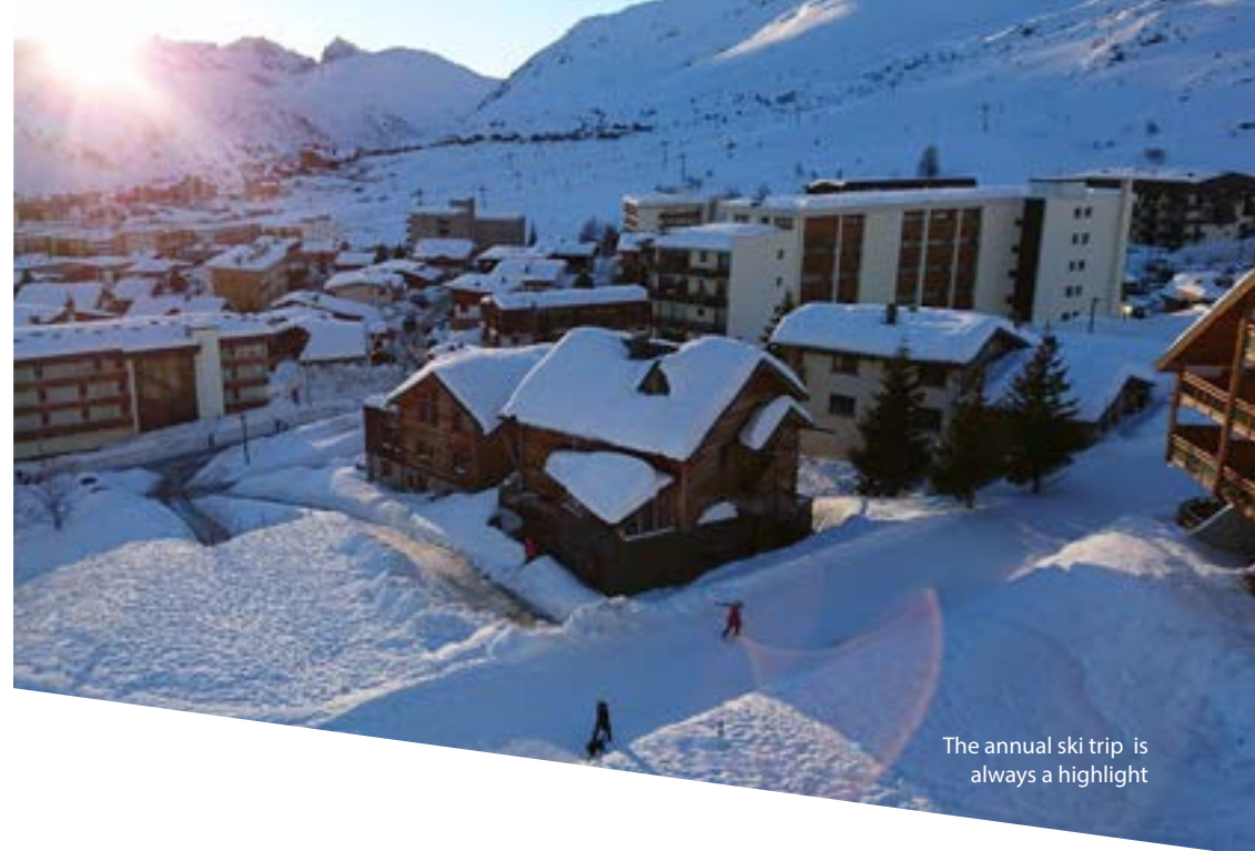
The annual ski trip is always a highlight

If your child chooses to study GCSE Art they will go on the following or similar trips: Eldmire - Unit 1 Art trip to Barcelona Thornton – Unit 2 Art trip to London