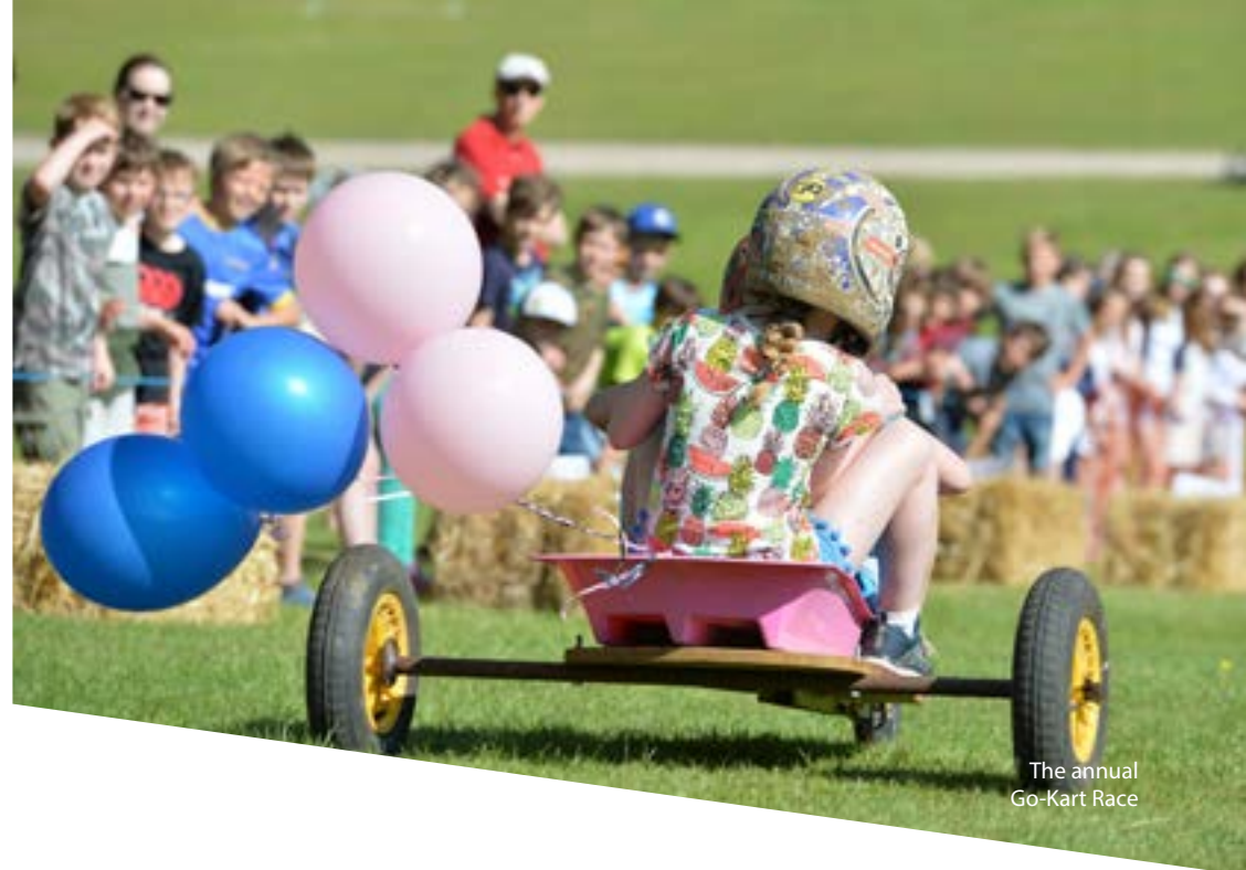
The annual Go-Kart Race