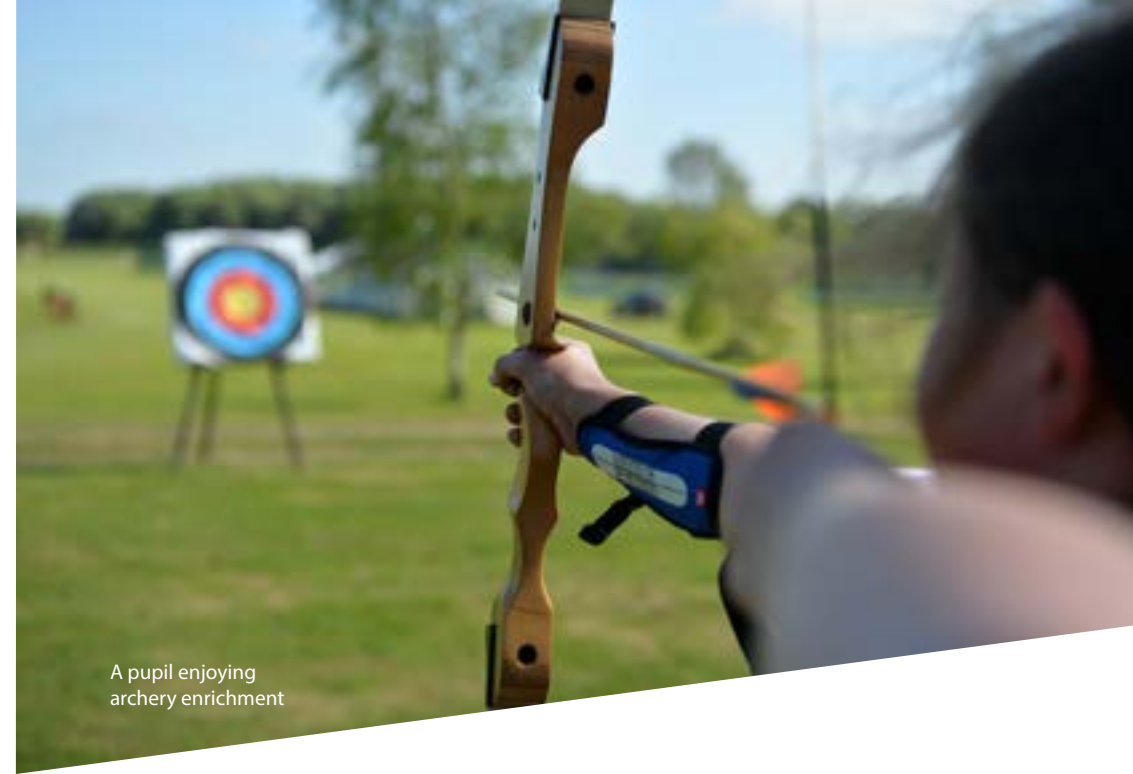
A pupil enjoying archery enrichment