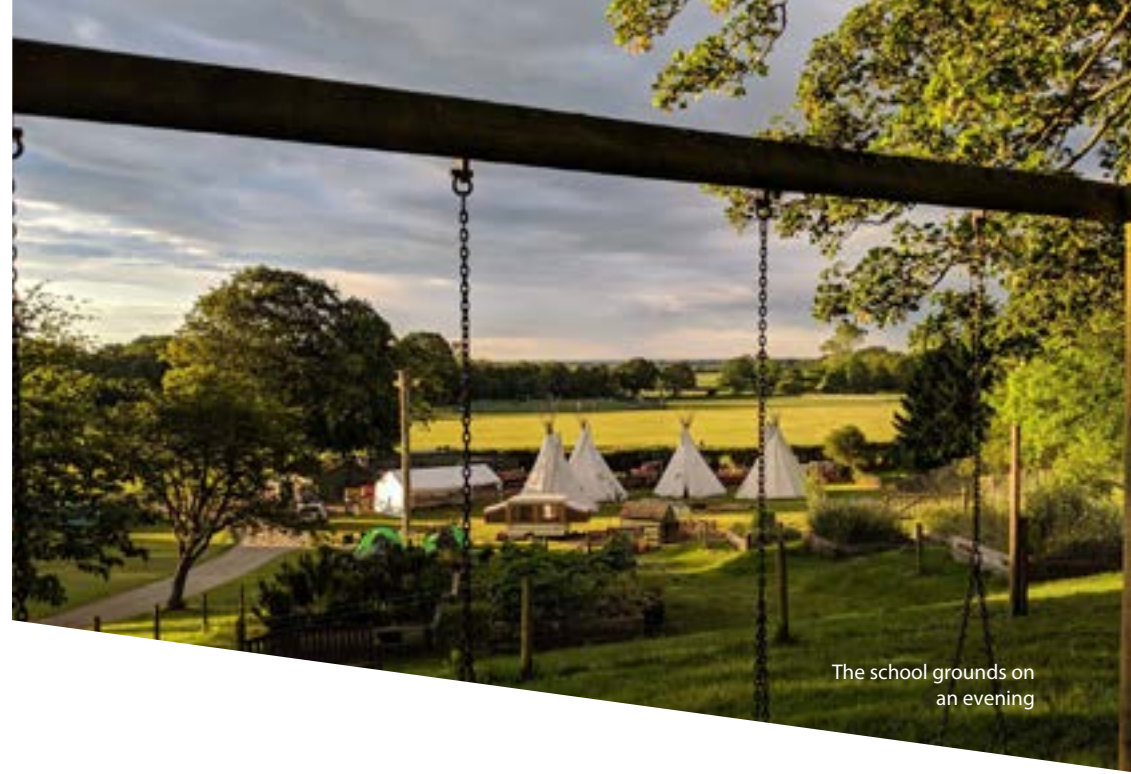
The school grounds on an evening